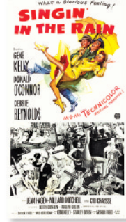
Auction Item: For a song?

Hollywood Prime will significantly grow Profile's inventory from 6,000 items a year to more than 20,000 items. That in turn means more objects that are affordable to the everyday buyer. "We will be selling items in the under