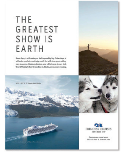
Idyllic: Images from ad campaign.

The campaign was created by Goodby Silverstein &